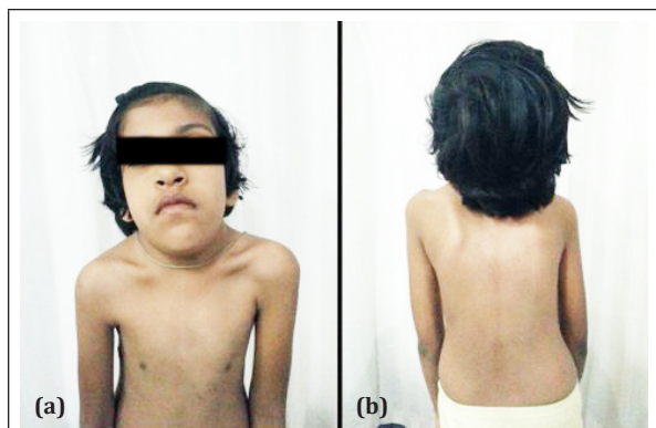
Figure 1: (a) A 9-year-old girl with Klippel-Feil syndrome, (b) Left Sprengel's deformity and low posterior hairline.

radiography of the chest revealed bilateral overcrowding of upper ribs with fusion of upper thoracic vertebra, bilateral absence of lower ribs, cardiomegaly with pulmonary plethora (Figure 2b). Abdominal ultrasonography revealed no anomalies.