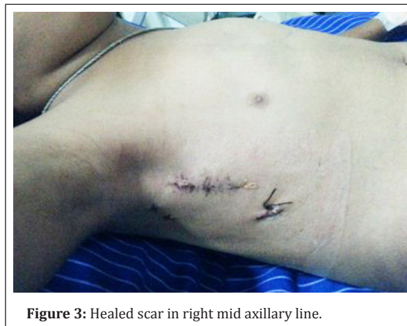
Figure 3: Healed scar in right mid axillary line.

on 4 th post-operative day. At the time of discharge she was in sinus rhythm with no residual defects with healed axillary thoracotomy wound (Figure 3).